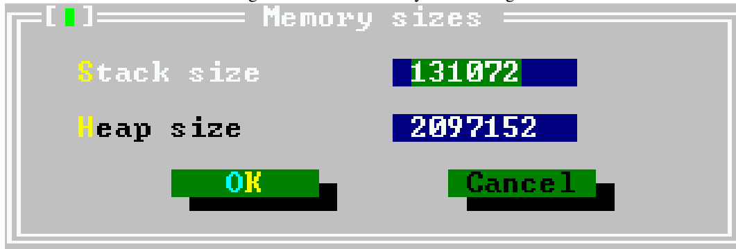
Figure 6.30: The memory sizes dialog

Stack size Sets the size of the stack in bytes (option -Cs on the command line). This size may be ignored on some systems.