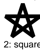
Figure 2-22: different line join styles

The line cap setting, adjusted using the setLineCap method, determines whether a terminating line ends in a square exactly at the vertex, a square over the vertex or a half circle over the vertex.