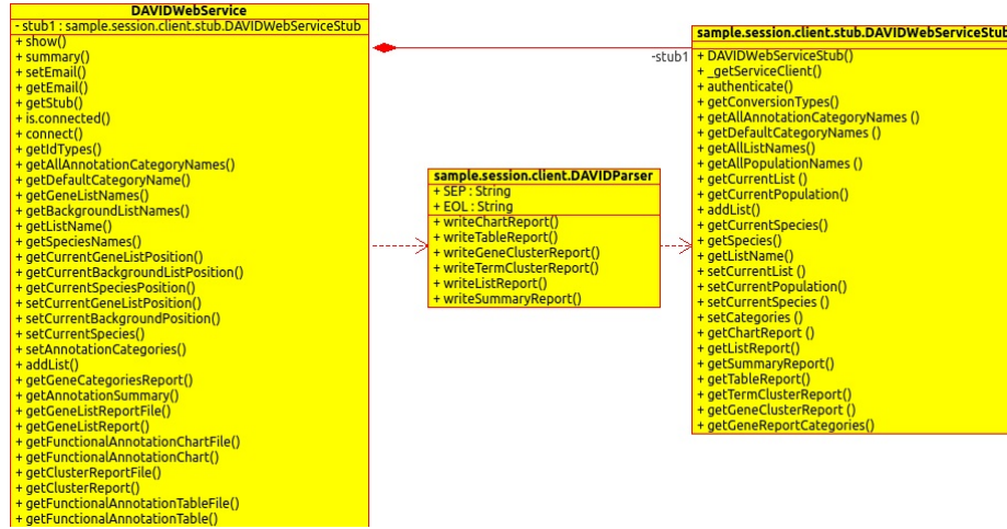
Figure 1: R-to-Java class diagram. RDAVIDWebService uses rJava to access/control DAVID web service through RDAVIDWebServiceStub and parse the reports back to R by DAVIDParser . Note that operation signatures have been omitted for simplicity.

The package implements RDAVIDWebService , a reference class object by means of R5 paradigm, for DWS communication through a Java client ( RDAVIDWebServiceStub ). This allows the establishment of a unique user access point (see Figure 1).