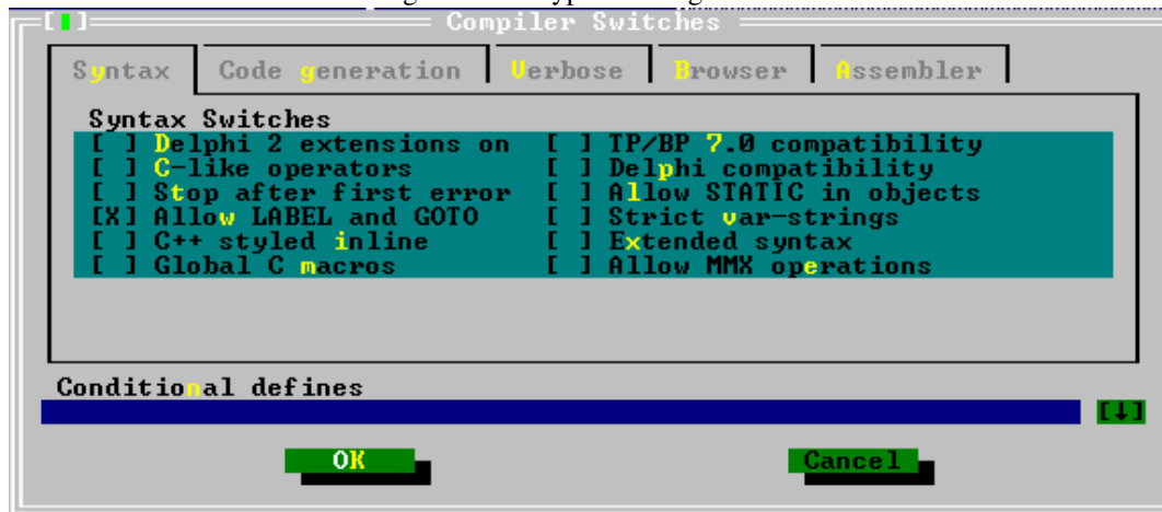
Figure 6.3: A typical dialog window