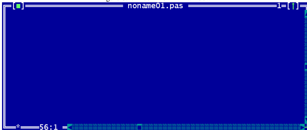
Figure 6.2: A common IDE window

The window is surrounded by a so-called frame , the white double line around the window.