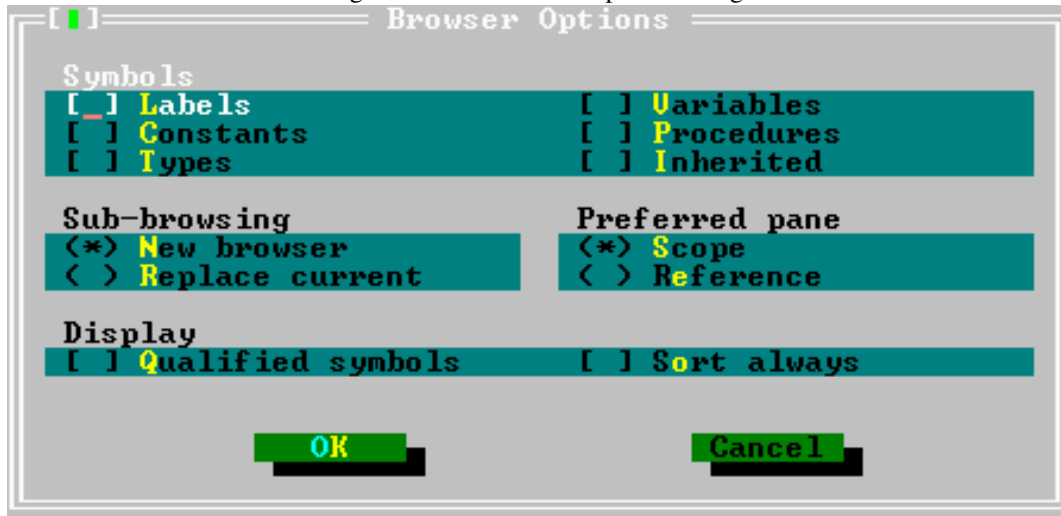
Figure 6.9: The browser options dialog.

Replace current The contents of the current window are replaced with the members of the selected complex symbol.