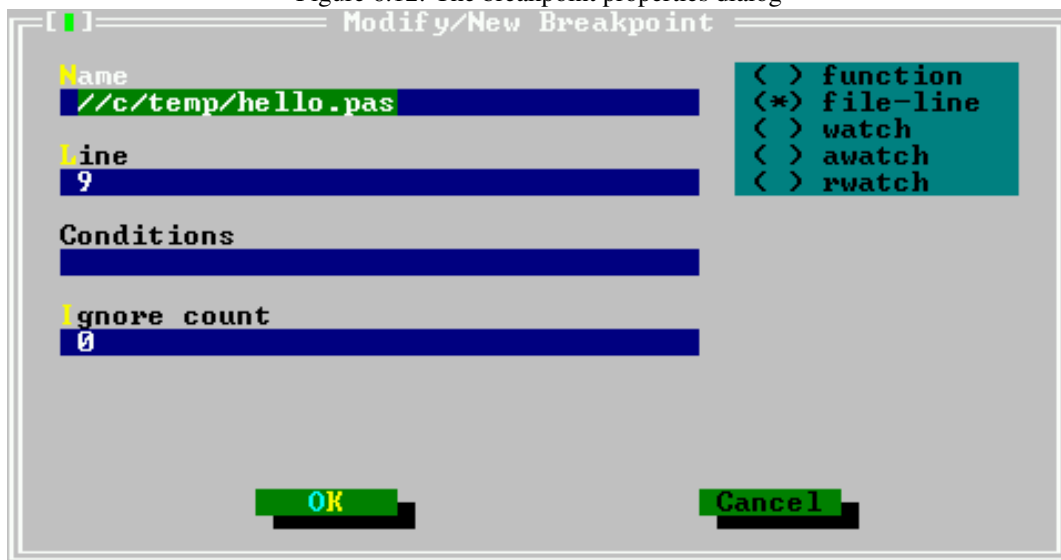
Figure 6.12: The breakpoint properties dialog

The dialog can be closed with the 'Close' button. The breakpoint properties dialog is shown in figure (6.12)