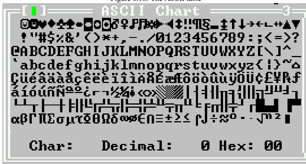
Figure 6.18: The ASCII table

The ASCII table remains active till another window is explicitly activated; thus multiple characters can be inserted at once. The ASCII table is shown in figure (6.18).